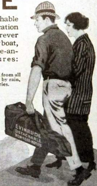
Circa 1917 Evinrude with optional Maxim Silencer