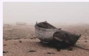
Just waiting for the right motor...