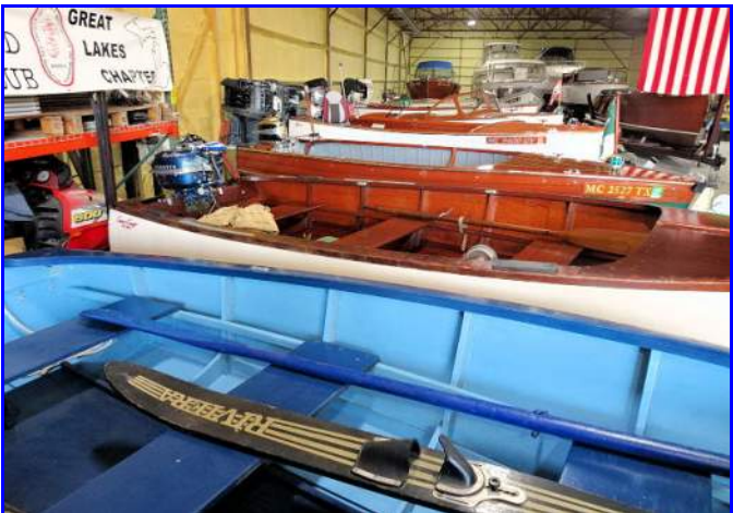
A line-up of vintage wooden boats, two Chris Craft kit boats and Lyman runabouts in the back ground