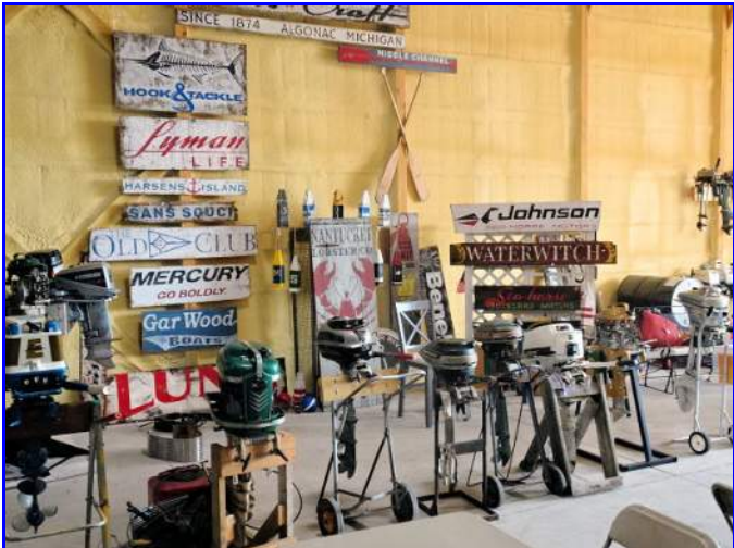
A part of the motor display & vintage marine signs for sale

Normally our meets are held on Saturdays, but we elected to have the Belle River event on a Sunday to correspond with the Maritime Days festival event program. Sunday is the big finale, with a car show and parade. The Sunday date was also appreciated by members that work weekends and can’t often attend Saturday meets. All in all, it was a good meet, lots of visitors, beautiful display of motors and classic boats. In addition to the boats and motors, we were visited by several cool cars: muscle cars, hot rods and a couple of antiques that had participated in the festival parade. One remarkable old “car” was a 1908 Sears Motor Buggy owned by Marine City resident Jim Cottrell. The “car” was of particular interest to us old motor lovers in that it was powered by an air cooled two cylinder opposed piston engine, an arrangement reminiscent of an Aero-Thrust outboard... except that this was a four cycle.