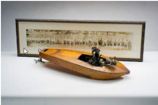
"Skip" Built by Bob Graham circa 1937 with hand built OHV 4-cycle motor