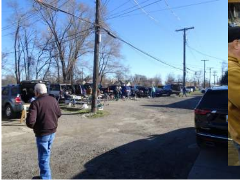
A bright sunny day on tailgate row